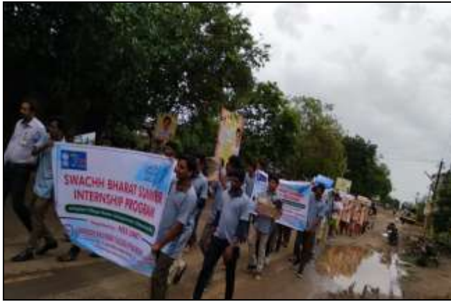
NSS Volunteers during Swachh Bharath Rally