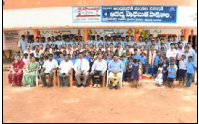
Volunteers Team of Swachh Bharath