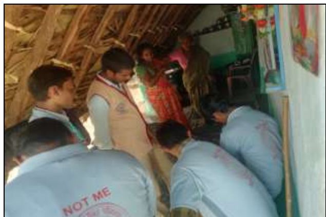
NSS Volunteers gathering the information about ODF