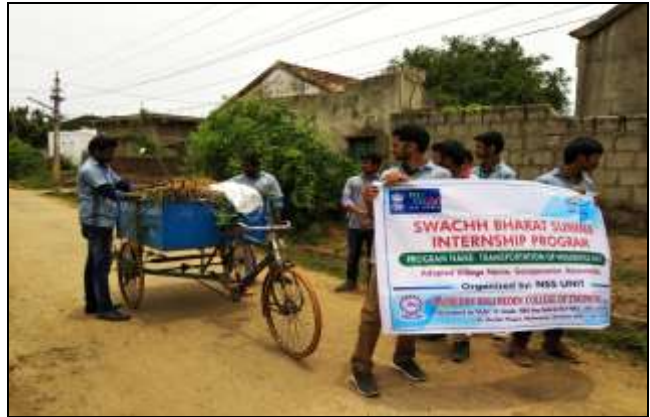
NSS Volunteers participating in Digging of Water-Pits NSS Volunteers collecting the Waste items