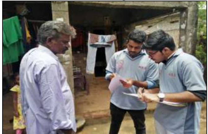
NSS Volunteers gathering information about ODF NSS Volunteers gathering information about ODF