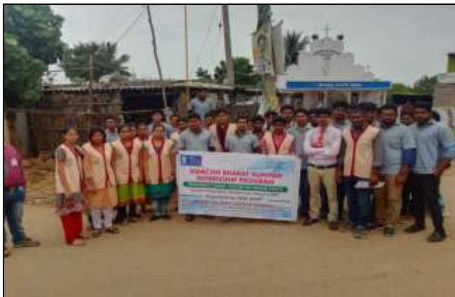
NSS Volunteers displaying the Banner